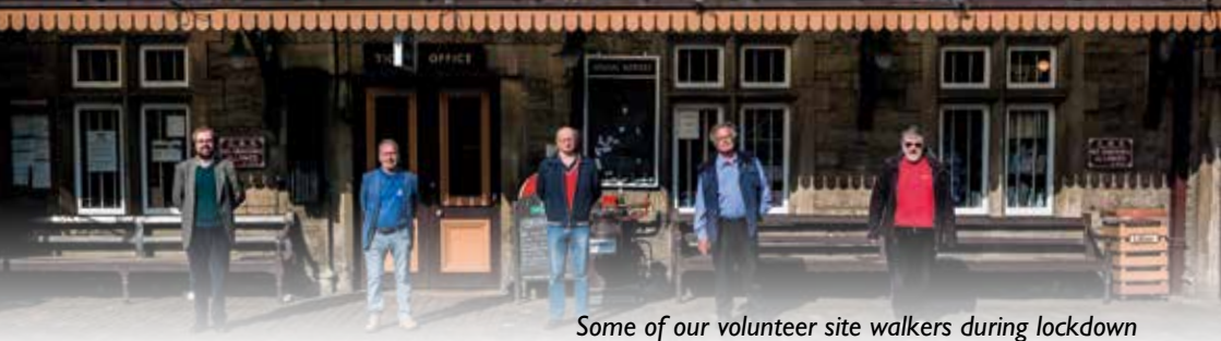
Some of our volunteer site walkers during lockdown