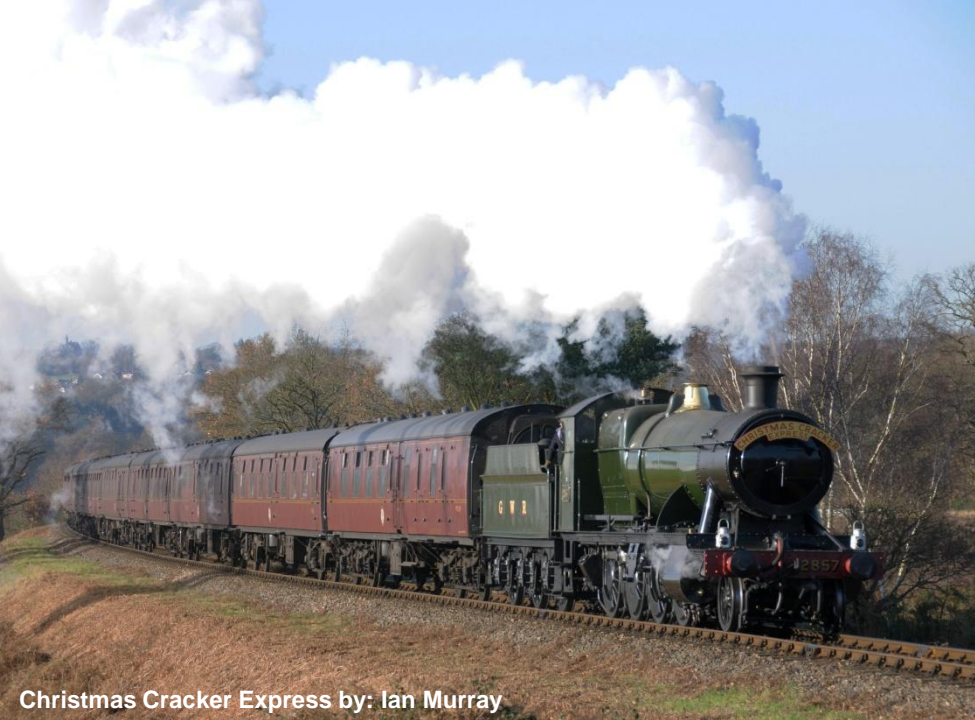
Christmas Cracker Express by: Ian Murray