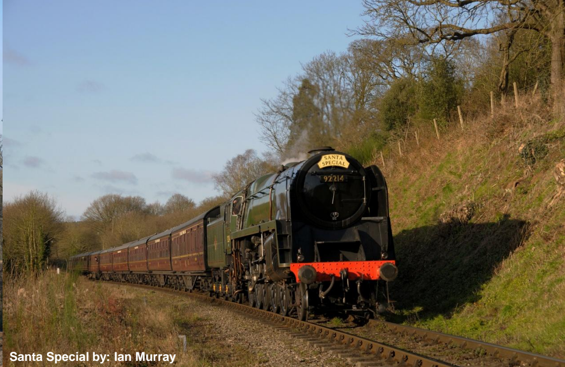
Santa Special by: Ian Murray