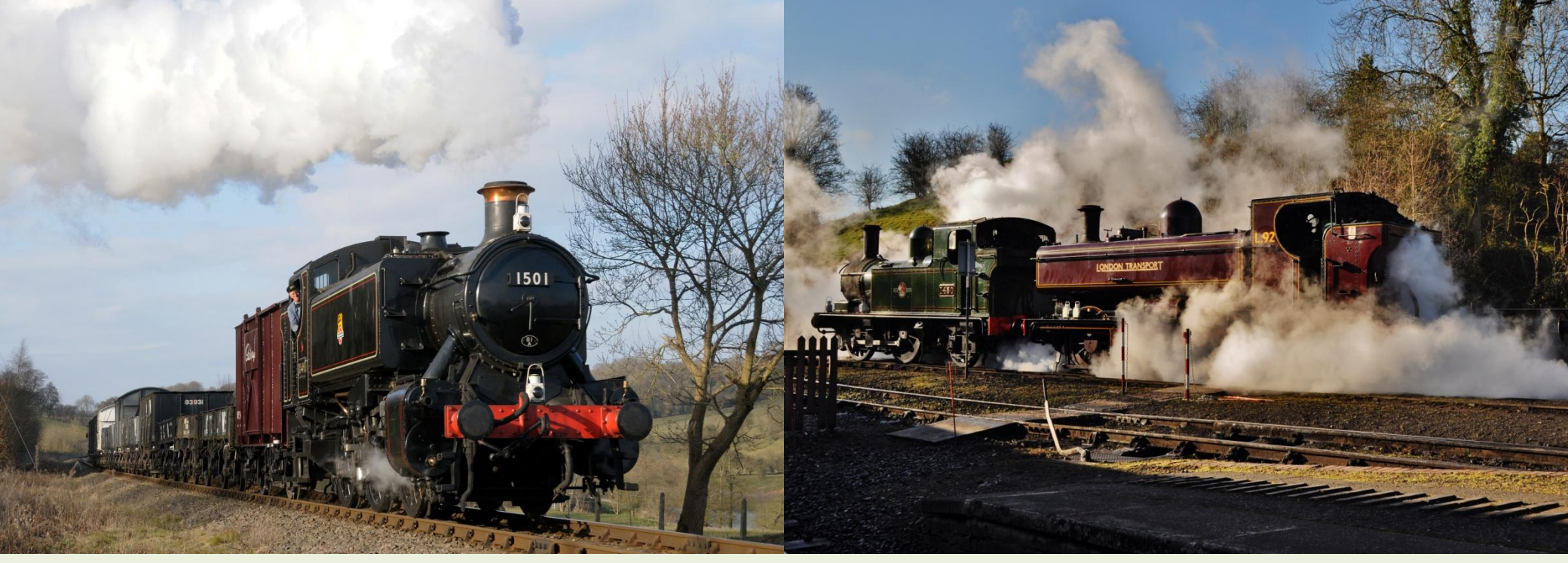
Spring Gala Highlights.