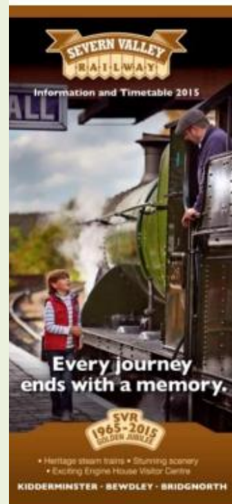
2015 Timetable brochure