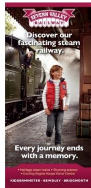
NEW visitor leaflet